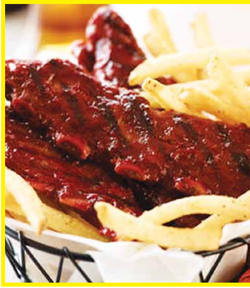
10 lb. box Pork Riblets