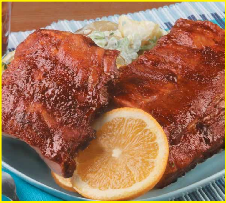
Baby Back Pork Ribs