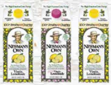
Newman's Own Ades 2 For $6 Selected Varieties. 59 oz. Carton