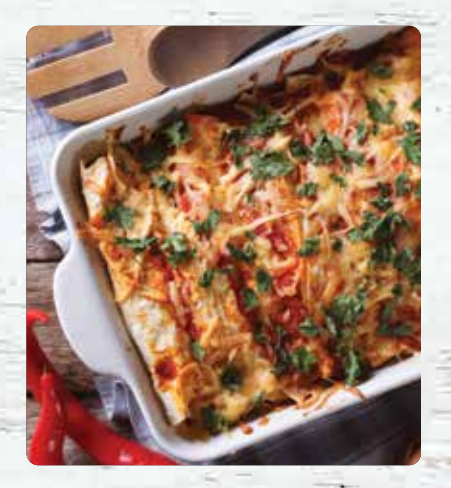
Chicken or Cheese Enchiladas $9.99<sub>/Lb.</sub>

Hot & ready! Enchiladas are perfect for a family meal, and they also reheat well, making them great for leftovers. Enjoy!