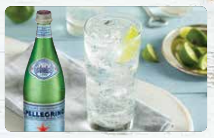
San Pellegrino Sparkling Water 2 For $4+crv Selected Varieties. 25.4 oz. Bottle