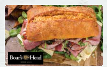
Black Forest Deluxe Ham $8.99/Lb. Fresh sliced to your order!