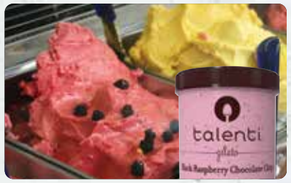
Talenti Gelato or Sorbetto $4.99/Ea. Selected Varieties. 16 oz. Tub

A large, juicy & red apple that is perfectly balanced with flavor & firm texture, making it ideal for snacking, cooking & baking.