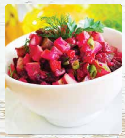
Fresh Beet Salad $7.99<sub>/Lb.</sub>

Hot & ready! Enchiladas are perfect for a family meal, and they also reheat well, making them great for leftovers. Enjoy!