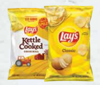
Lay's Classic or Kettle Cooked Chips 2 For $7 Selected Varieties. 5-8 oz. Package