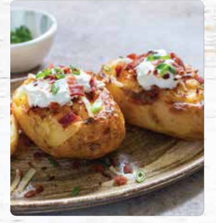
Twice Baked Potatoes $7.99<sub>/Lb.</sub>

Salads $8.99/Ea. We have an assortment of different salads to choose from. Perfect for a quick and easy lunch!