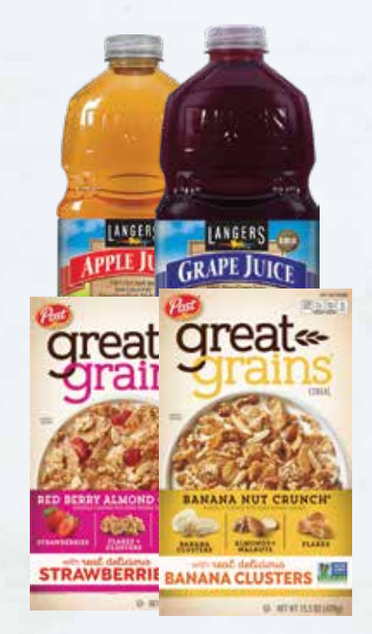
Langers Juice Selected Varieties. 64 oz. Bottle