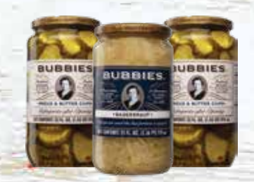
Bubbies Pickles or Sauerkraut $7.99 Selected Varieties. 25-33 oz. Jar