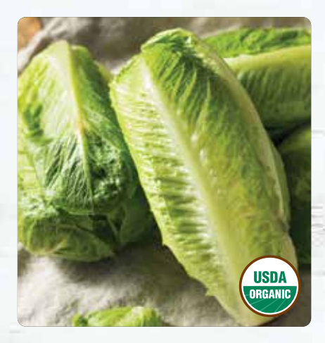
Organic Romaine Hearts $3.99/Ea.

Their tough skin and sweet, nutty flesh, making them perfect for roasting, baking, or even using in soups and stews.