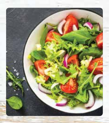
Grab & Go Salads

A delicious and vibrant dish that can be both refreshing and hearty. Packed with nutrients!