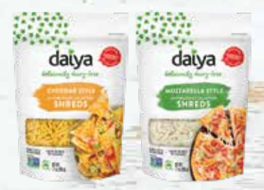
Daiya Shredded Non-Dairy Cheese $4.99 Selected Varieties. 7.1 oz. Package