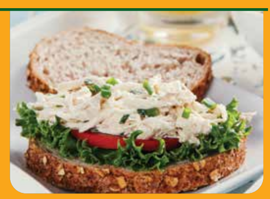
Chicken Salad Sandwich 8 oz. Package