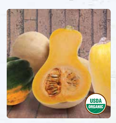
Organic Hard Squash $1.49/Lb.

Their tough skin and sweet, nutty flesh, making them perfect for roasting, baking, or even using in soups and stews.