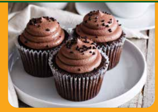
Large Size Gourmet Cupcakes Selected Varieties, 6 oz. Package

Nice size bakers at an even better price.