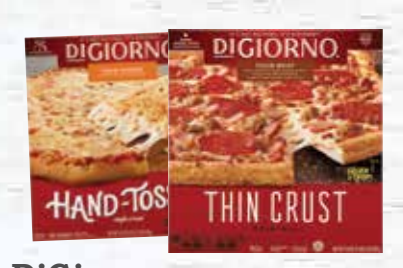
DiGiorno Pizza $5.99 Selected Varieties. 17-25 oz. Package