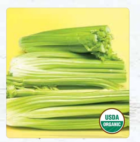
Organic Crisp Celery $1.99/Ea.

These hearts are perfect for making a Caesar Salad. Don't forget the parmesan & croutons. Sold in a 3 Count Package.